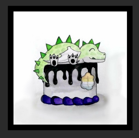
ACE AROund the Cake – der Podcast von & für asexuelle/aromantische Menschen → Podcast