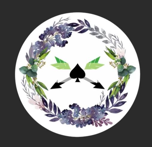
ace_arovolution → Blog

AktivAro – Für mehr Aromantik auf der Welt → collective working to increase visibility of the aromantic spectrum